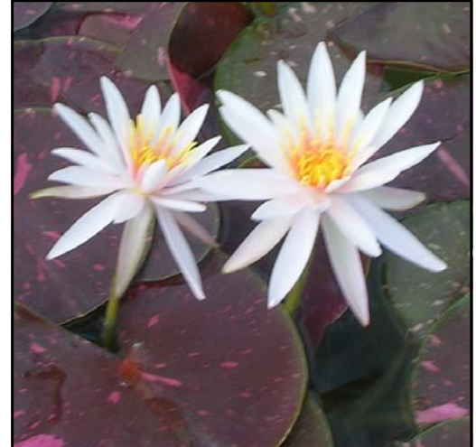
Nymphaea Arc-en-Ceil Latour-Marliac, 1908, Hardy, Day Blooming