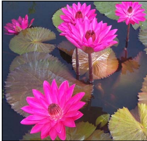
Nymphaea Antares Longwood Gardens, 1962 Tropical, Night Blooming