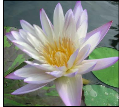
Nymphaea Moon Beam Florida Aquatic Nurseries, 2002 Tropical, Day Blooming