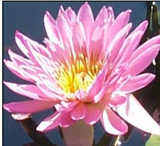
Nymphaea Pink Passion Florida Aquatic Nurseries, 1998 Tropical, Day Blooming