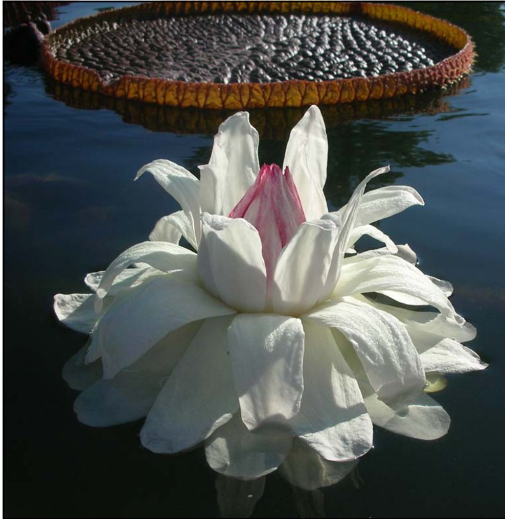
Victoria 'Adventure' Hybridized by Knotts, Styler and Summers, 1999 Tropical, Night Blooming