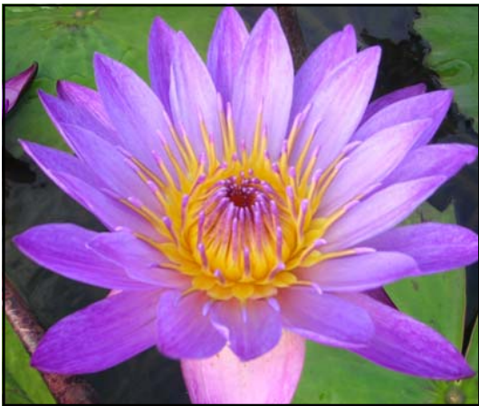
Nymphaea Lindsey Woods Florida Aquatic Nurseries, 2008 Tropical, Day Blooming