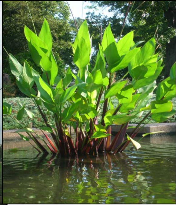
↑ Thalia ( Thalia delbata ) ← Tropical