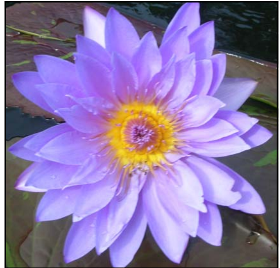
Nymphaea William McLane Florida Aquatic Nurseries, 1997 Tropical, Day-Blooming