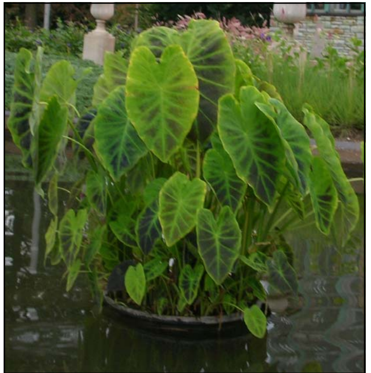
Taro/elephant's ear ( Colocasia esculenta ) Tropical