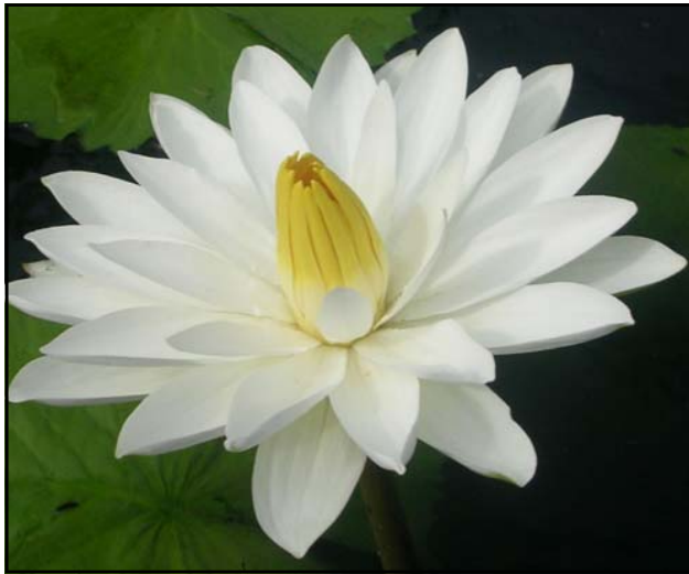
Nymphaea Trudy Slocum Slocum, 1948 Tropical, Night Blooming