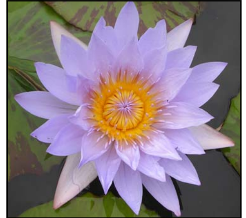
Nymphaea Key Largo Florida Aquatic Nurseries, 2001 Tropical, Day Blooming