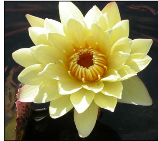
Nymphaea Carla's Sunshine Florida Aquatic Nurseries, 2003 Tropical, Day Blooming,