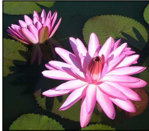
Nymphaea Emily Grant Hutchings Gurney, 1922 Tropical, Night Blooming