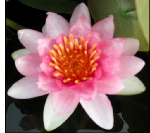
Nymphaea Fabiola Latour-Marliac, 1908 Hardy, Day Blooming