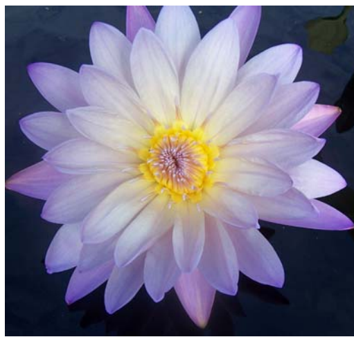
Nymphaea Blink Florida Aquatic Nursery, 2008 Tropical, Day Blooming