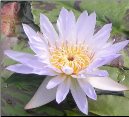
Nymphaea Southern Charm Florida Aquatic Nurseries, 2001 Tropical, Day Blooming

(Line 1=water lily ( Nymphaea ) name; Line 2=hybridizer and date of introduction; Line 3 and 4= lily type)