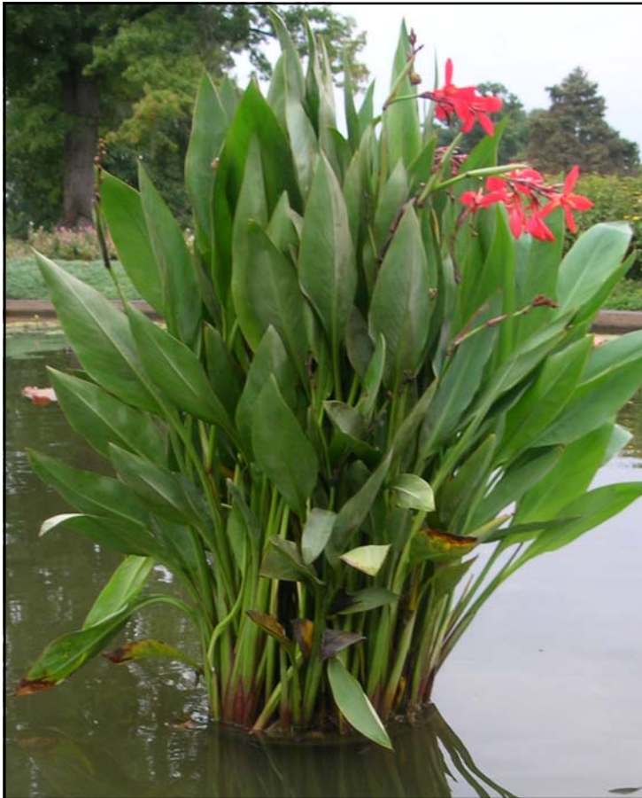
Water Canna ( Cannaceae ) Tropical