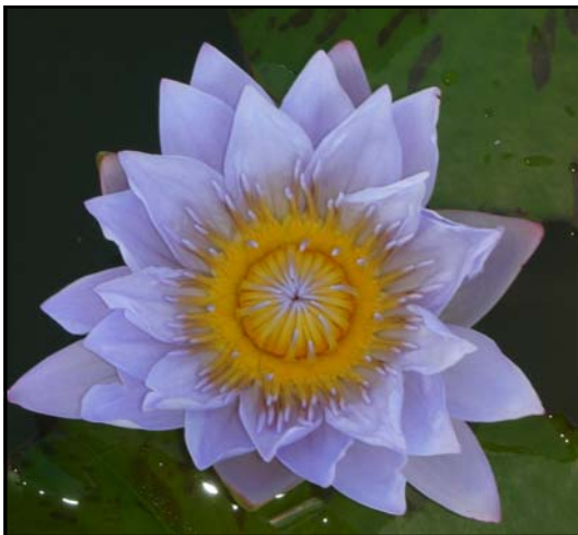
Nymphaea Pamela Koch, 1931 Tropical, Day Blooming