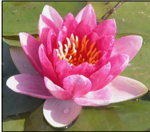
Nymphaea James Brydon Dreer, 1899 Hardy, Day Blooming