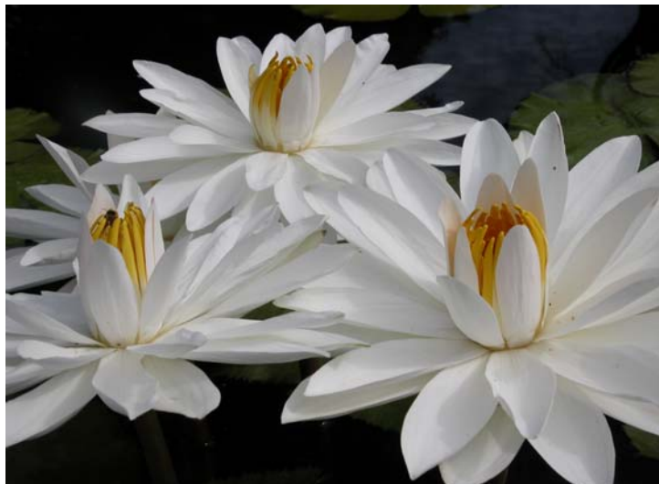
Nymphaea Woods White Knight Woods, 1989 Tropical, Night Blooming