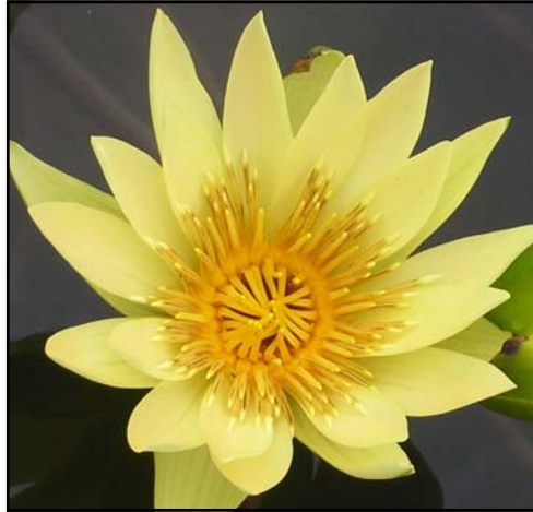
Nymphaea St. Louis Gold Pring, 1956 Tropical, Day Blooming