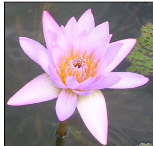
Nymphaea Ruby Bryne, 1998 Tropical, Day Blooming, Viviparous