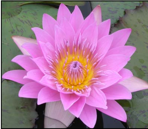
Nymphaea General Pershing Pring, 1917 Tropical, Day Blooming

(Line 1=water lily ( nymphaea ) name; Line 2=hybridizer and date of introduction; Line 3 and 4= lily type)