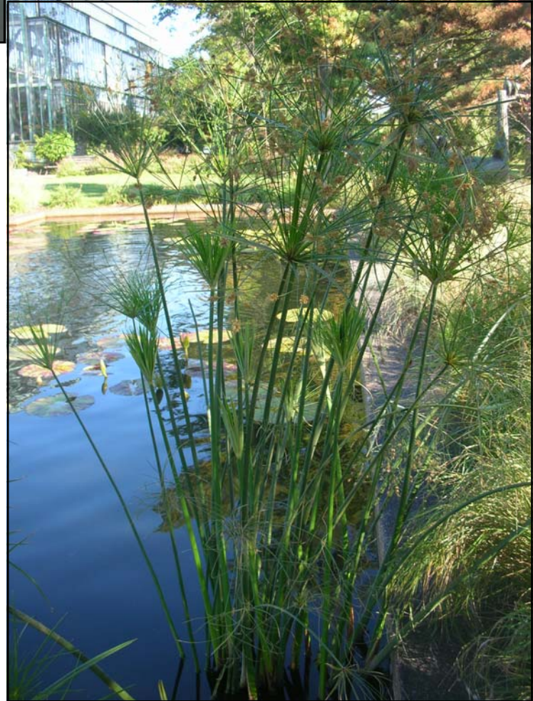
Egyptian Papyrus ( Cyperus papyrus ) Tropical