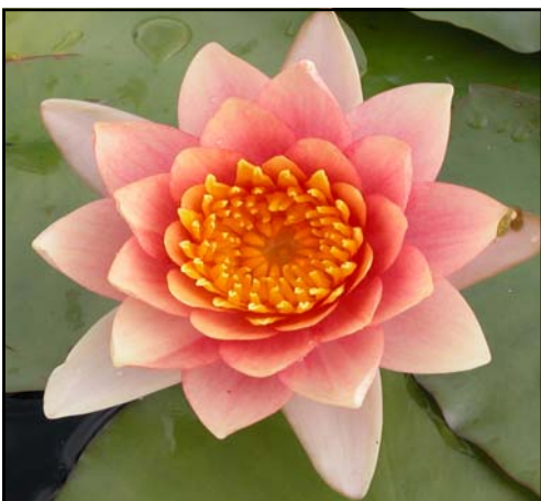
Nymphaea Comanche Latour-Marliac, 1908 Hardy, Day Blooming Changeable Colors