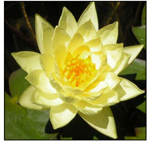
Nymphaea Sunrise Perry, 1947 Hardy, Day Blooming