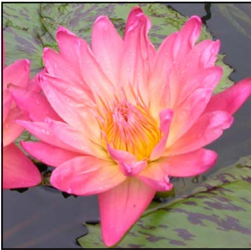
Nymphaea Albert Greenberg Birdsey, 1967 Tropical, Day Blooming

(Line 1=water lily ( nymphaea ) name; Line 2=hybridizer and date of introduction; Line 3 and 4= lily type)