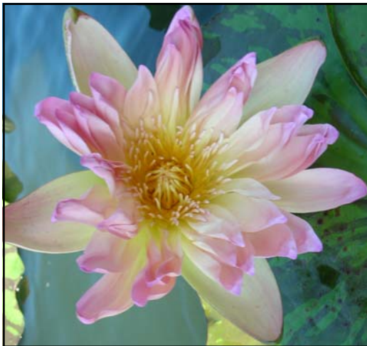
Nymphaea Barbara Barnette Florida Aquatic Nurseries, 1996 Tropical, Day Blooming